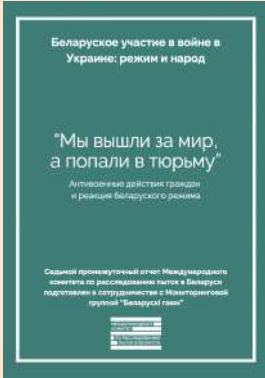
Belarusian participation in the war in Ukraine: regime and people