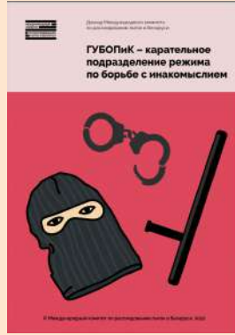
GUBOPiK — punitive unit of the regime to combat dissent