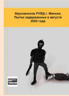
Torture in the Frunzensky District Department of Internal Affairs on August 9-13, 2020